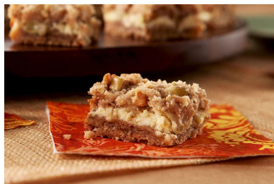
Recipe from kraftrecipes.com

Preheat oven to 350°F. Mix flour, brown sugar, 1/2 cup of the granulated sugar and the cinnamon; cut in butter using pastry blender or two knives until mixture resembles coarse crumbs. Stir in walnuts. Reserve 2 cups of the crumb mixture for topping; press remaining crumb mixture firmly onto bottom of 13x9-inch baking pan.