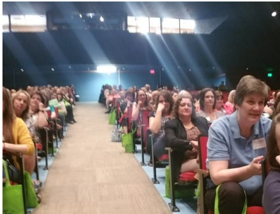
Listening attentively to the keynote presentation