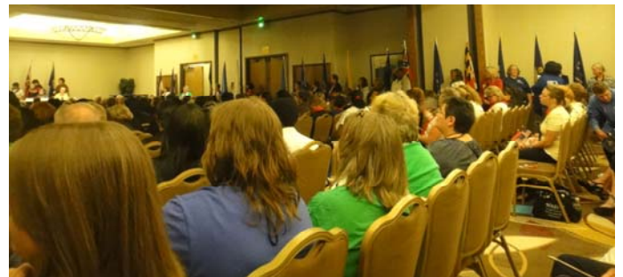
2014 NAEOP General Session flag ceremony.