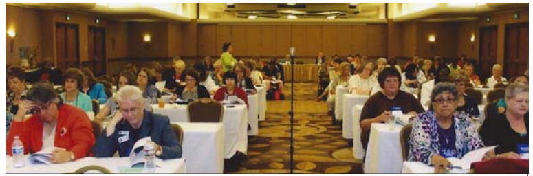
2014 NAEOP Advisory Council

My time at the conference gave me the opportunity to meet some great women from Washington, South Carolina and New York that I will happily continue to network with. I encourage you to take any opportunity to broaden your horizons... locally (GAEOP), state (UAEOP) and nationally (NAEOP). Mark your calendar for the next NAEOP conference held July 22-25, 2015 in Buffalo, New York - near Niagara Falls. You won't want to miss out on this great experience. If you would like more information about NAEOP, visit NAEOP.org .