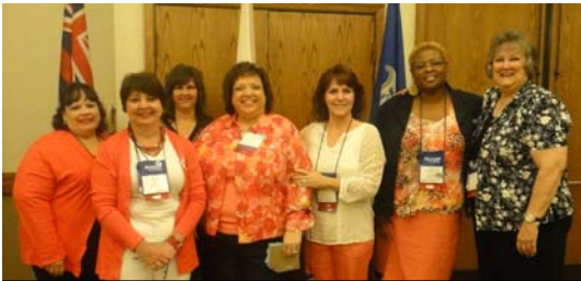
2014 NAEOP Advisory Council Pages

I also had the opportunity to serve as a delegate for the Advisory Council and as Page (distributing voting cards, ballots and collecting voting ballots, etc.) during the NAEOP Business Meeting. Now, I will be the first one to admit that I do not like politics, but the Advisory Council is organized for a very specific reason. As the affiliates presented issues to the Advisory Council, I enjoyed listening to the discussions that took place - I felt like I was in a courtroom (my secret love). It was one of the many highlights of my time there. The Advisory Council process gives NAEOP members the